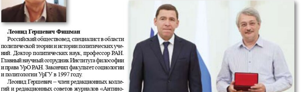
Главный научный сотрудник Института философии и права УрО РАН. Закончил факультет социологии и политологии УрГУ в 1997 году.

Владелец литературного агентства Perkins Literary Agency (Нью-Йорк). Независимый исследователь. Обладатель степеней Master of Theological Studies (Южный методистский университет, Даллас, Texac), Master of Arts по европейской истории (Университет Лондона). См. стр. 90